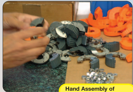
Hand Assembly of Automatic Pipe Cutters

Toolbank list almost 200 Monument products, but we manufacture over 700 items as shown in the Monument catalogue. Non-listed items are available 'as specials' from Toolbank with the minimum of delay. The 54-page Monument catalogue is available ex-stock from Toolbank - free of charge.