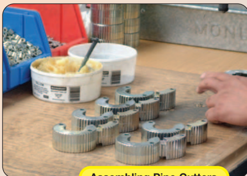
Assembling Pipe Cutters

Monument exhibited at the 5-day Interbuild exhibition at the NEC in April when many 1,000's of tool buying tradesmen attended. We were pleased to support PTS members by handing the PTS 'postcard' advertisement to all visitors to our stand. Visitors to our factory reception area will see the same literature available for them to collect.