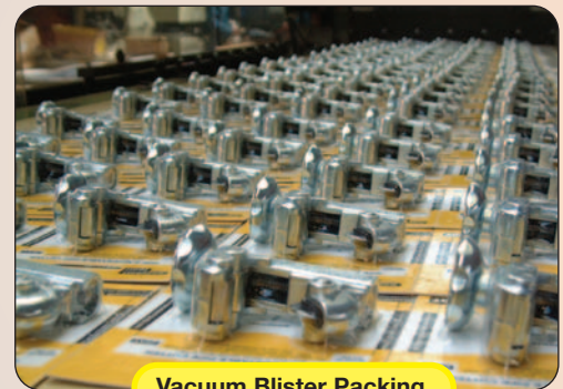
Vacuum Blister Packing

and the 15PC type automatic cutters. The latest addition to the range is the 28PC model which is designed specifically for the automatic cutting of 28mm copper pipe. Monument are also famous for their range of roofing tools based on a comprehensive assortment of 28 different dressing tools for the roofing industry.