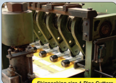
Skinpacking size 1 Pipe Cutters